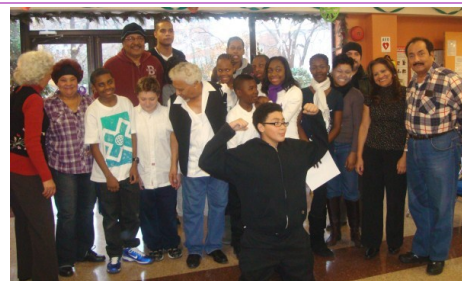
Children from nearby Douglass Houses visited the Center for caroling.