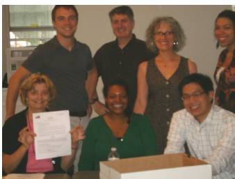
WSFSSH development staff and some of the Claremont staff gathered for the family housing lottery.