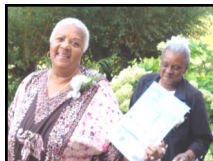
Some of the grandparents in procession.

Grandparents processed to "When the Saints Come Marching In." Grandparents, grandchildren, and staff spoke about the impact of this very special place.