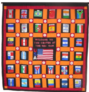
Welcome To The Center, a quilt created by Center members.

During the last five years, the Center has increased membership, diversified activities, and expanded its meal program for neighborhood seniors. This year has added Korean language programming for the more than 40 members for whom Korean is the primary language.