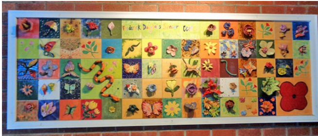
Ceramic Tile Mural created by Frederick Douglass Center members hangs outside the Center's front door.

In July, WSFSSH contracted with the New York City Department for the Aging to operate the Frederick Douglass Senior Center, located inside The Douglass Houses, at 102nd & Amsterdam in Manhattan. WSFSSH began operations on August 6, 2015. The Center has a long history of outstanding ceramics instruction and award winning ceramic art. The Center even has its own kiln.