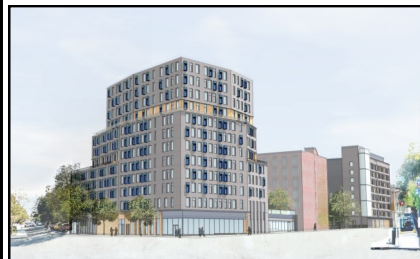
Rendering of Tres Puentes & Borinquen from 3rd Ave. & 138th St.

WSFSSH's Tres Puentes project will add two buildings, 172 new units of low income senior housing,