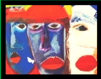
Three Faces by Bernet Cline