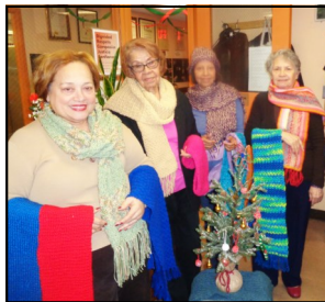
Artists and their art!

This year gifts at Valley Lodge Shelter will have a truly personal touch. Members of the Center @ the Red Oak crocheted scarves for every Valley Lodge resident!