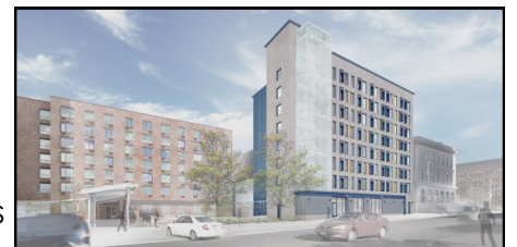
Borinquen (left) East Building (right)

Enterprise Green Communities guidelines. The buildings will have blue roofs—to help decrease the effects of storm water runoff. We have included a generator for both buildings to contribute to the project's resiliency.